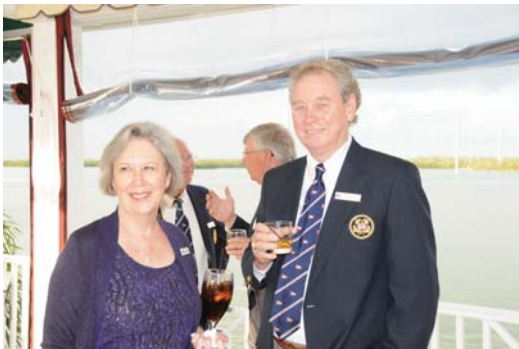
More Welcome Aboard Photos