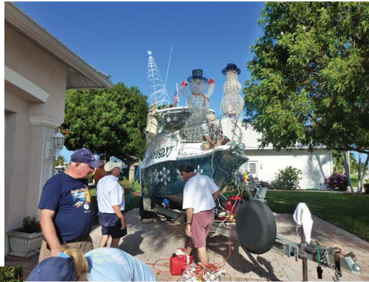
Hard at work decorating our entry