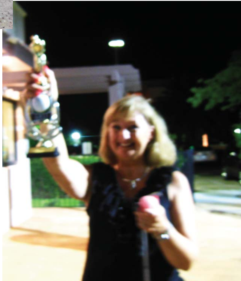
GRAND PRIZE WINNER