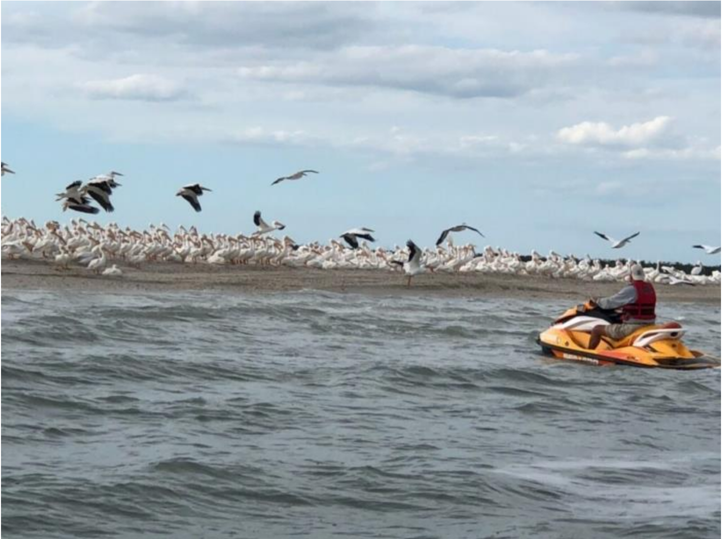
Jet skiing in the Ten Thousand islands.

When I received the flyer with regards to the Jetski group, I thought “wow” what a neat experience, if only I had a Jetski.